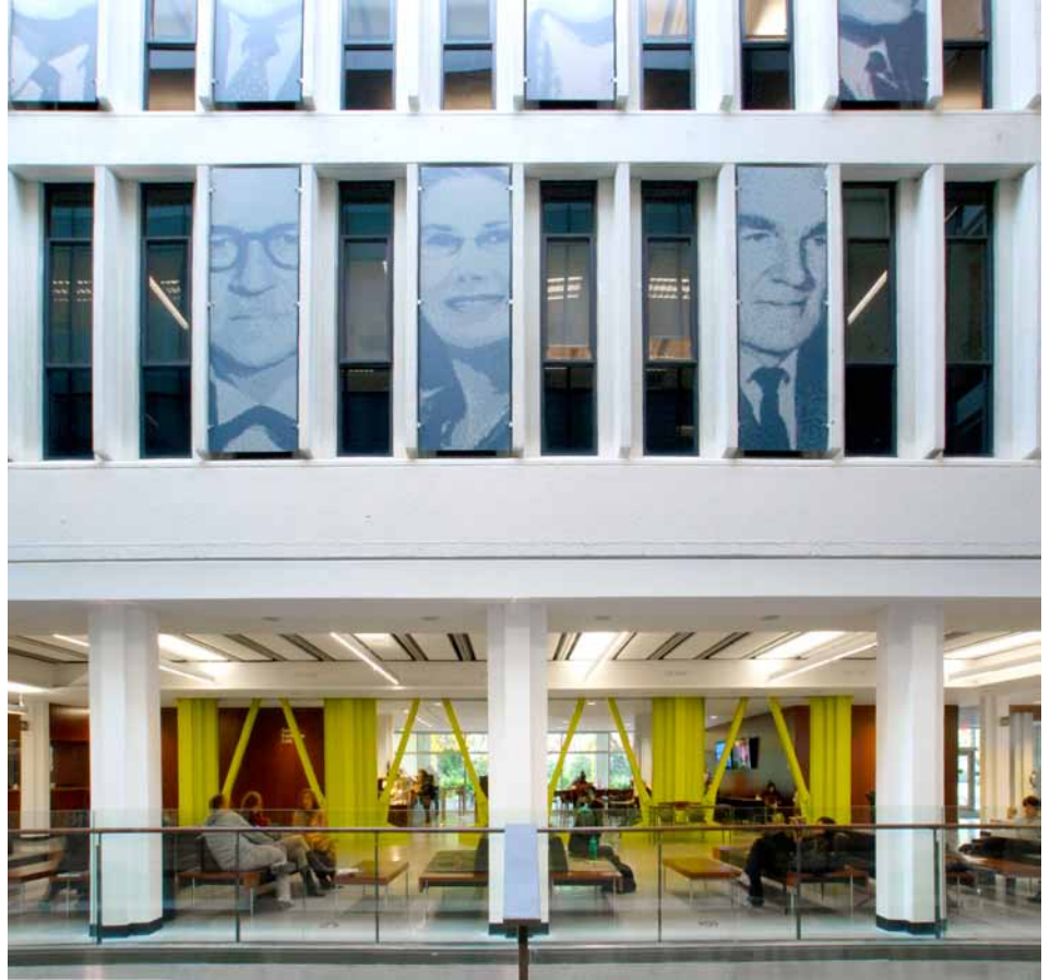
Large-scale images of the donors overlook the atrium where the students gather.